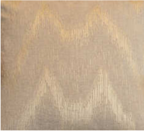
CABRERA 211914 Natural/Gold 100% Linen - 140 cm